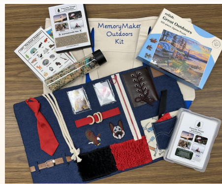
ABOVE PHOTO: Contents of a Memory Maker Kit

activity/discussion cards, and a fidget blanket, and the items are contained in a labeled tote bag. Kits may be checked out for 2 weeks.